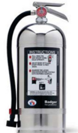
Class K Extinguisher